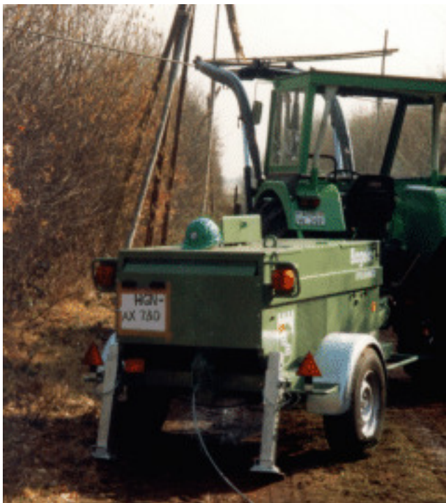
Winch KW 3F at dismantling job on a 110 kV overhead-line