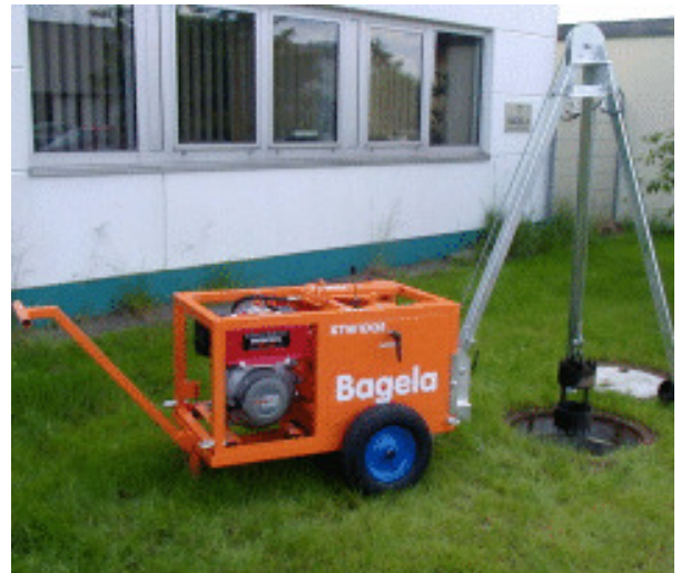
KTW 1005 with wheels, tow bar and triple beam (extra accessories) for sewerage cleaning jobs.