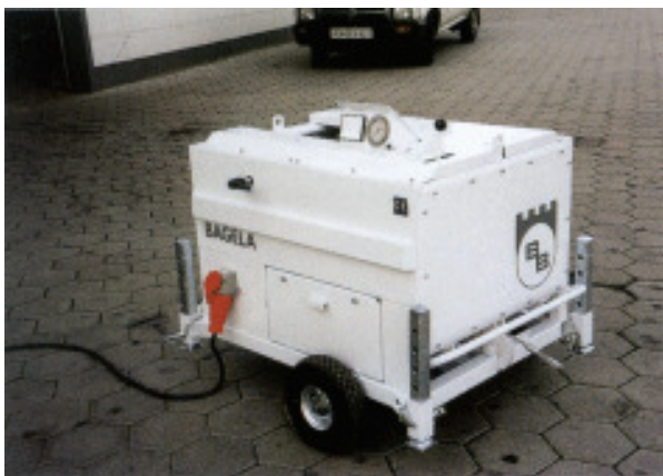
KTW 1000 with electric motor and supporting jacks