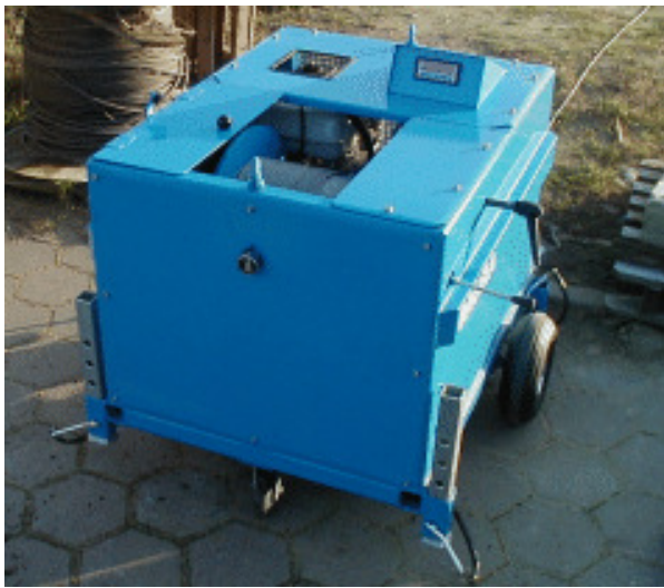
KTW 1000 with petrol engine and transport wheels

This drum-type winch is driven hydraulically by either petrol or electric motor. Mounted on a steel section frame, the winch forms a neatly closed and very compact unit.